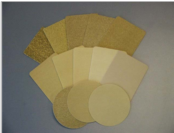
Diamond ScrubPADS and ScrubDISKS available in grits 180-4000.

For ordering information, please check out the Products Page of our website: www.foamtecintlwcc.com .